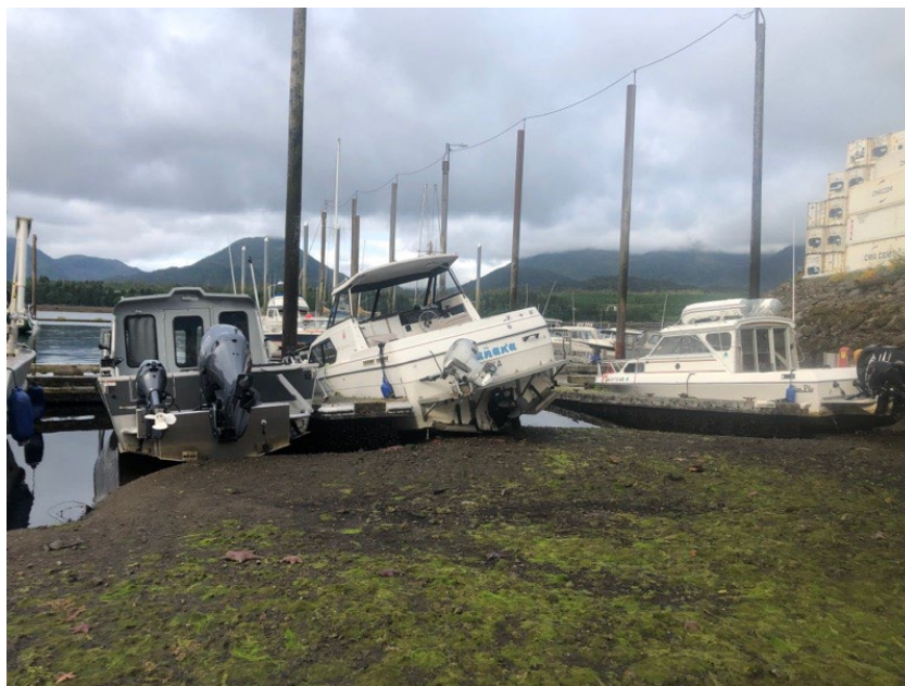
Photo 1. Vessels grounded due to sedimentation from Hoadly Creek.

A budget amendment in the amount of $156,288 from the Harbor Reserves to Project 24-38 BHN Maintenance Dredging is requested to perform much needed maintenance dredging in Bar Harbor North near the mouth of Hoadly Creek. Historically the area is dredged every two to three years as sediment builds up. This was last done in 2022. This area has filled in significantly over the past couple of years and is now impeding access to stall holders in this area at low water.