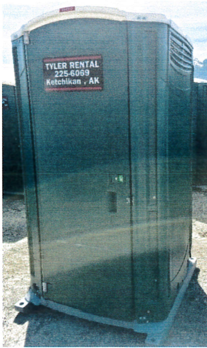
Standard With A Sink