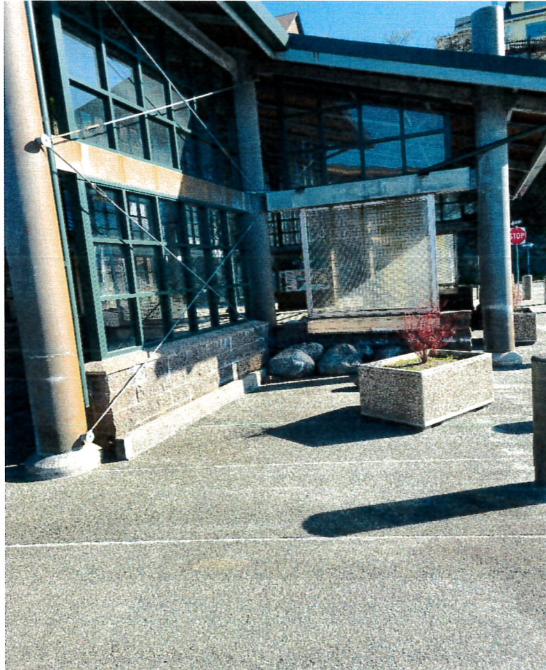
Location of Portable Restrooms